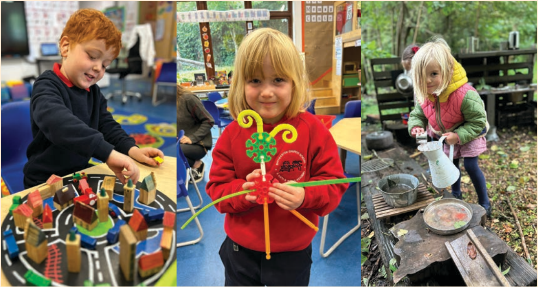
Our new Apple class enjoying their learning and exploring everything we have to offer